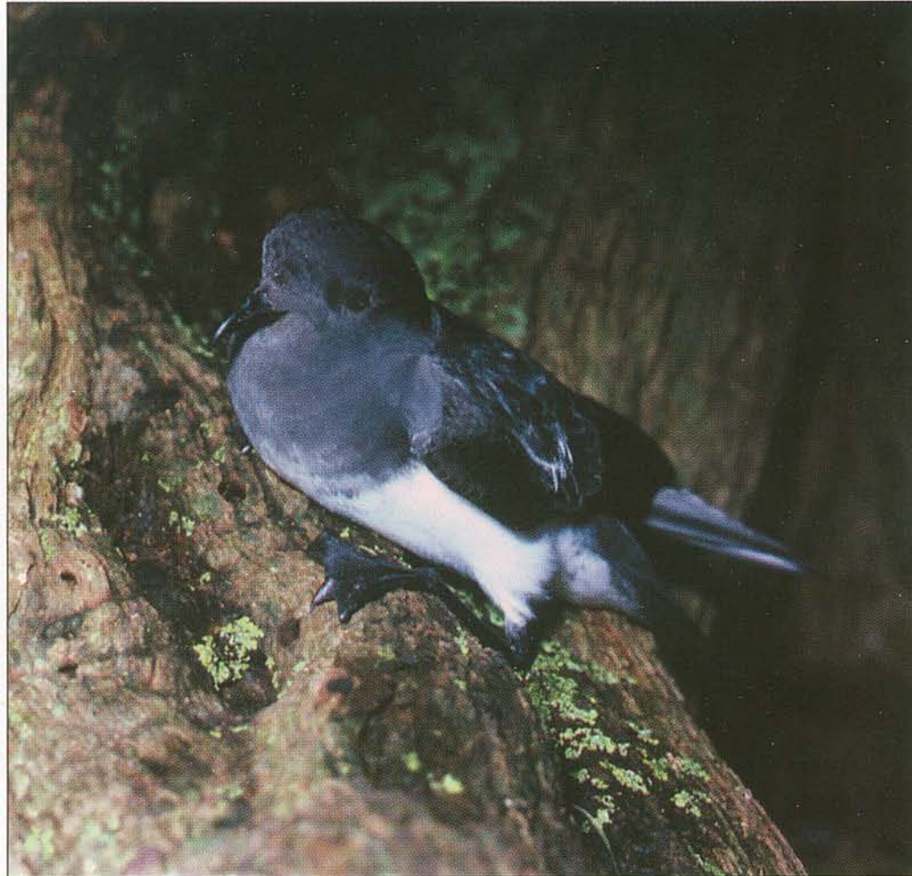
Grey-backed storm petrel, Rangatira.

Storm petrels are the smallest seabirds, and the grey-backed storm petrel is the smallest New Zealand storm petrel. It has a dark grey head, neck, throat and upper breast, and the back, upper-wings and tail are grey, paler towards the rear. The rest of the underparts are white. The tail is square, and the bill and feet are black. At sea it is usually seen alone, darting in the wave troughs. Little is known of numbers. The main New Zealand breeding colonies are on the Chatham, Antipodes and Auckland Islands. There are possibly 10-12,000 pairs on the Chatham Islands, breeding on Rangatira, Mangere, Little Sister Island, The Pyramid, Star Keys, the Murumurus, Rabbit Island, Houruakopara and the stack and islet to the east of Houruakopara. Storm petrels are extremely vulnerable to mammalian predators, and so are restricted to rat-free sites. Grey-backed storm petrels breed over August-March, nesting on the surface under dense vegetation, and occasionally in shallow crevices.