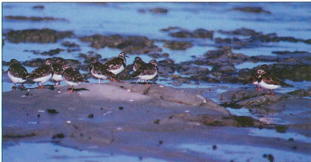
Turnstones in non-breeding plumage.