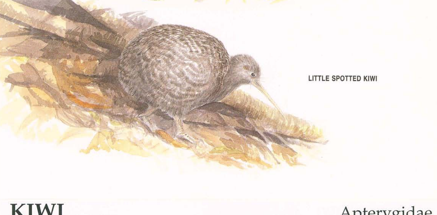
LITTLE SPOTTED KIWI