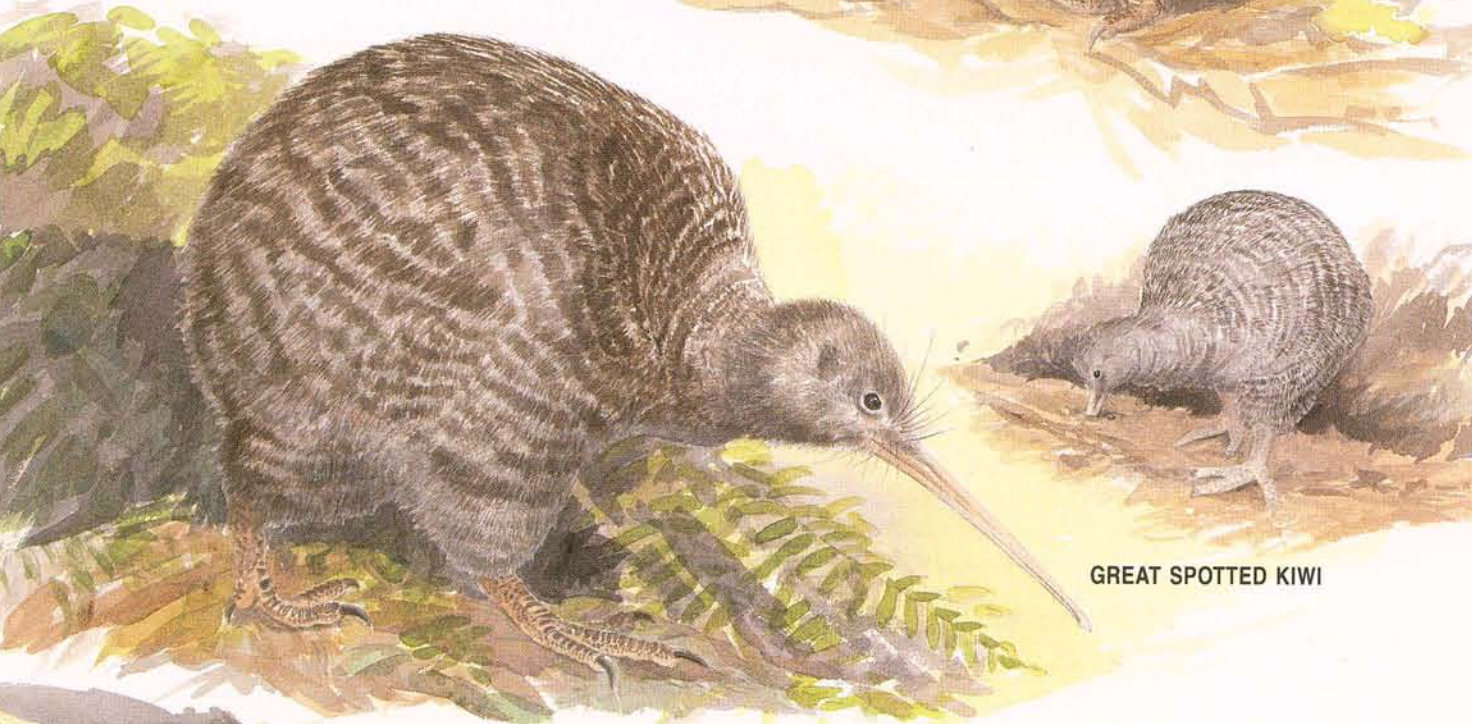
GREAT SPOTTED KIWI