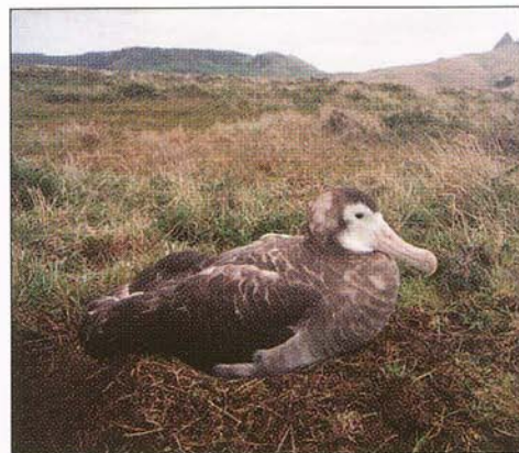
Adult female Antipodean albatross incubating, Chatham Island, April 2003.