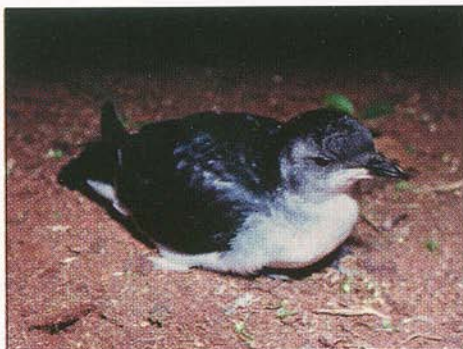
Adult southern diving petrel, Rangatira.