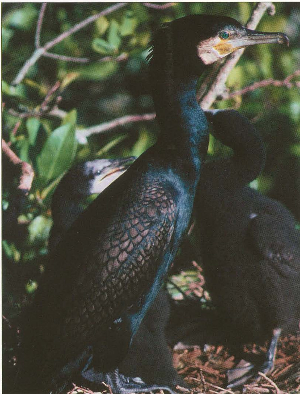
Black shag at nest.